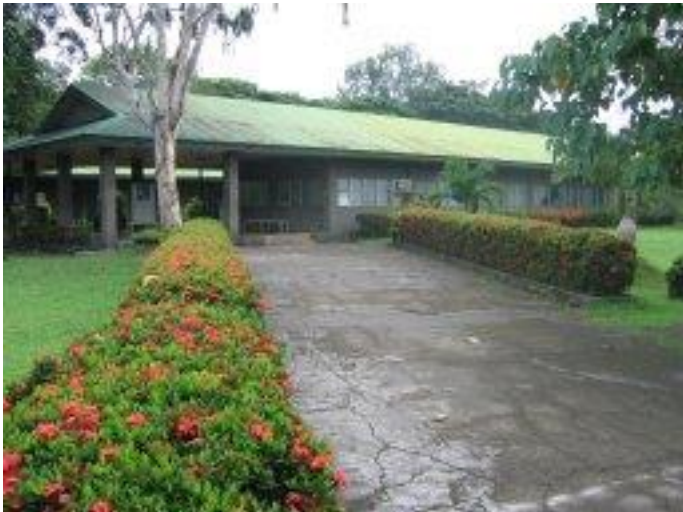
College Façade and Main Entrance