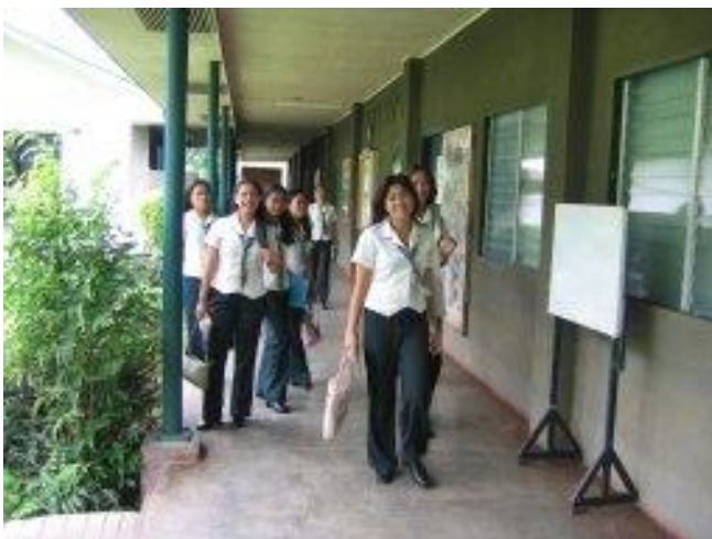
Right-wing Corridor and Offices