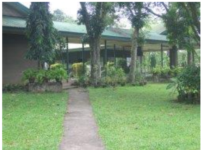
School Buildings and Grounds