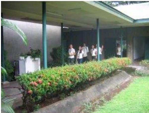
Corridor at the back of the Chapel