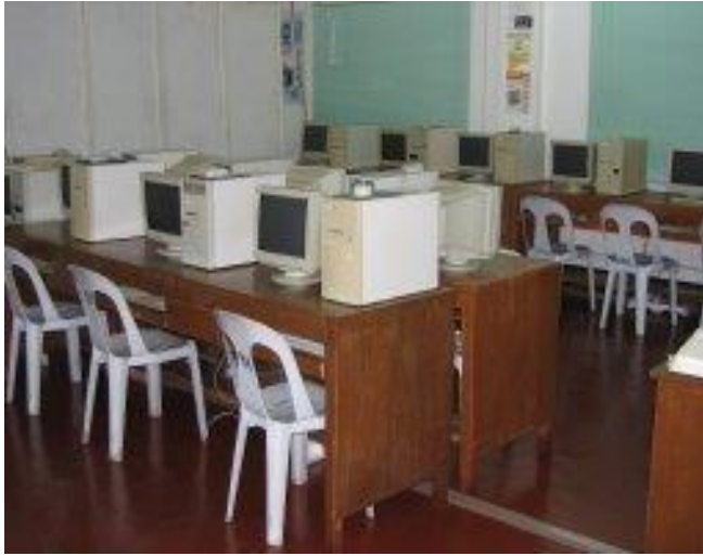
Computer Lab 1