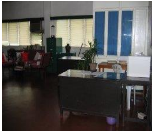
SPS / SSG Office