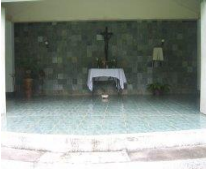
The School Chapel