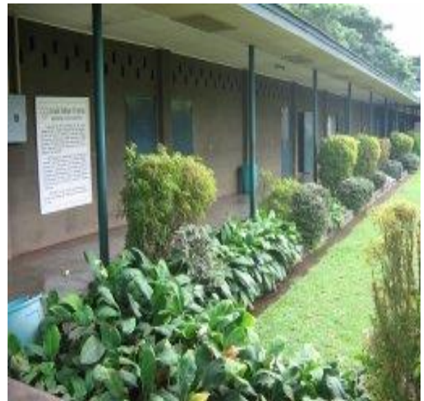
Left-wing Corridor and Classrooms