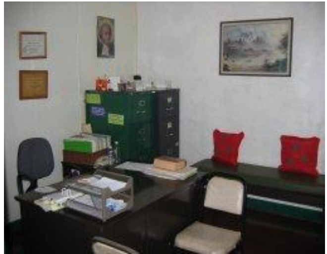
Office of Guidance and Admission Director