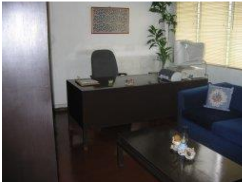
Office of the Dean