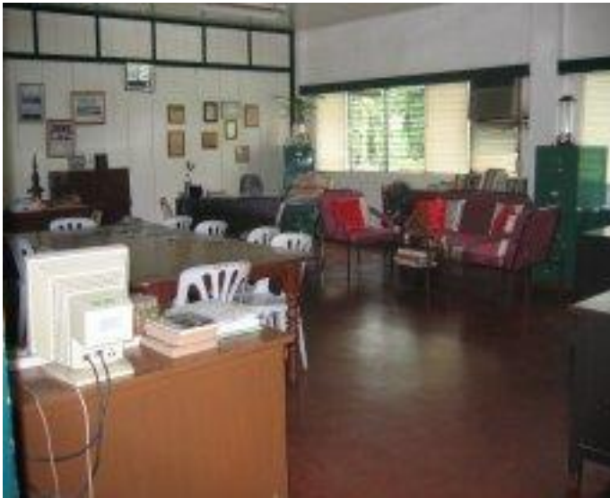
Office of the SPS Director